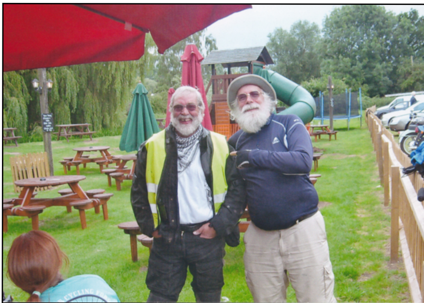
El Presidente is reunited with his long lost brother