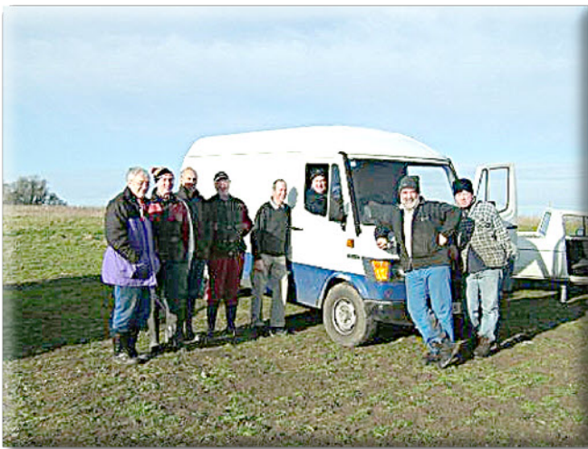
Bromley Brook Working Party