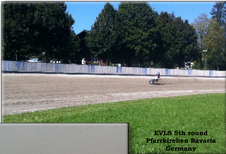
EVLS 5th round Pfarrkirchen Bavaria Germany

traffic for the weekend, there is a fair, food stalls and all the bars have entertainment. We raced on the Sun-