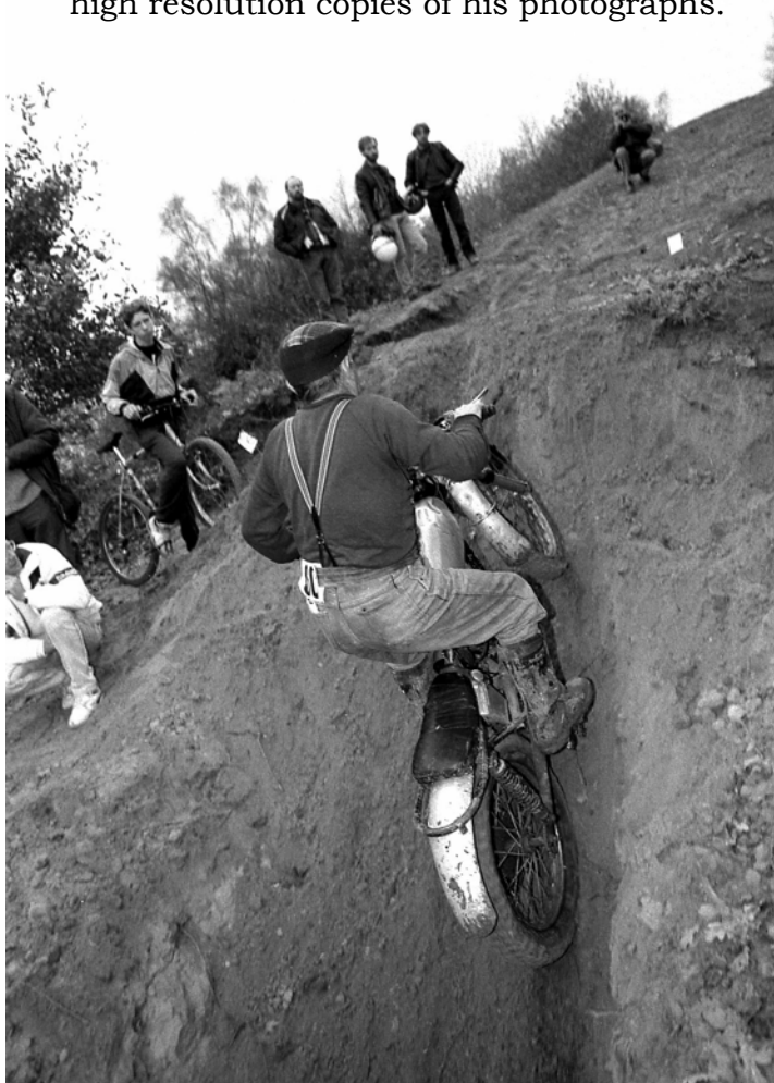
Thumpers 1991 rider 60 or 80? (EFA id 16)

Terry can be contacted by email: terryhowephoto@hotmail.co.uk phone: 01787 281282 or through his web site where you can also purchase high resolution copies of his photographs.