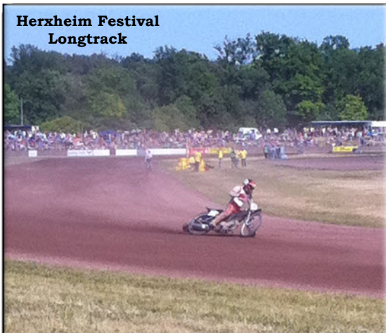
Herxheim Festival Longtrack

We were invited to ride Speedway in Zolder, Belgium and this saw us compete as part of Team Viking. The team achieved a very good 3 rd – all riders were on laydown's except us, we were on an old upright GM scoring 5 points.