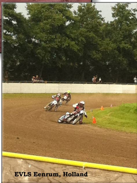
EVLS Eenrum, Holland