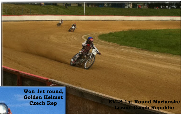
EVLS 1st Round Marianske Lazne, Czech Republic

bourne Ladies Day in support of Help for Heroes. This was followed in March, joining others at Scunthorpe, for a JAP