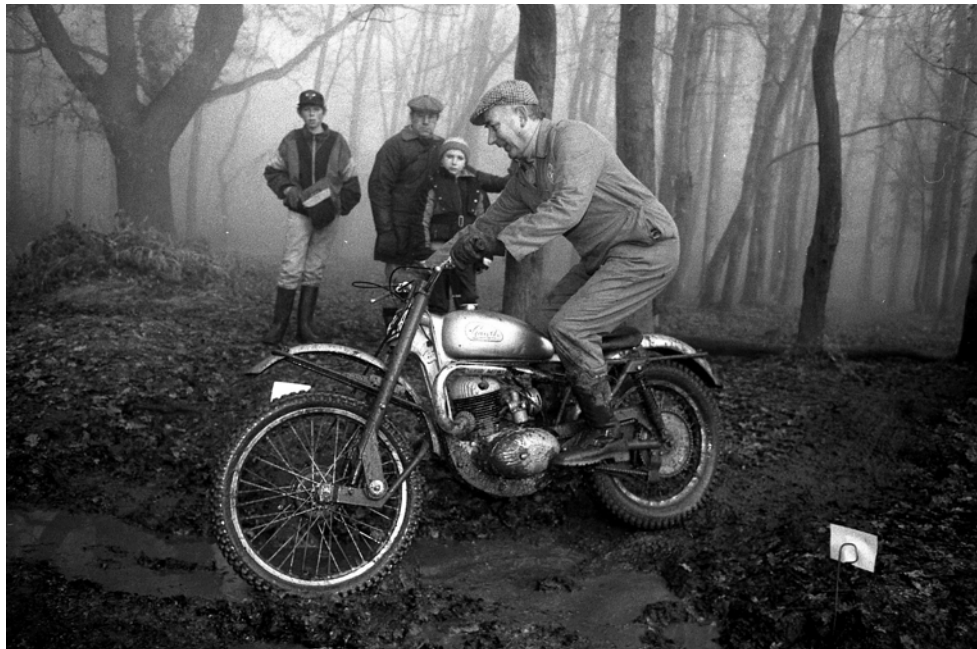
Thumpers 1991 (EFA id 18)