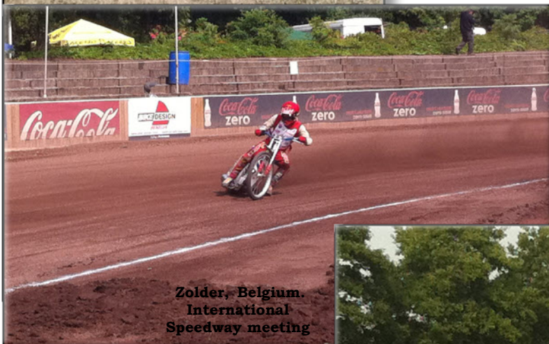
Zolder, Belgium. International Speedway meeting