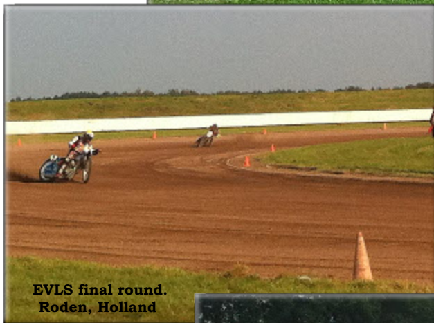
EVLS final round. Roden, Holland