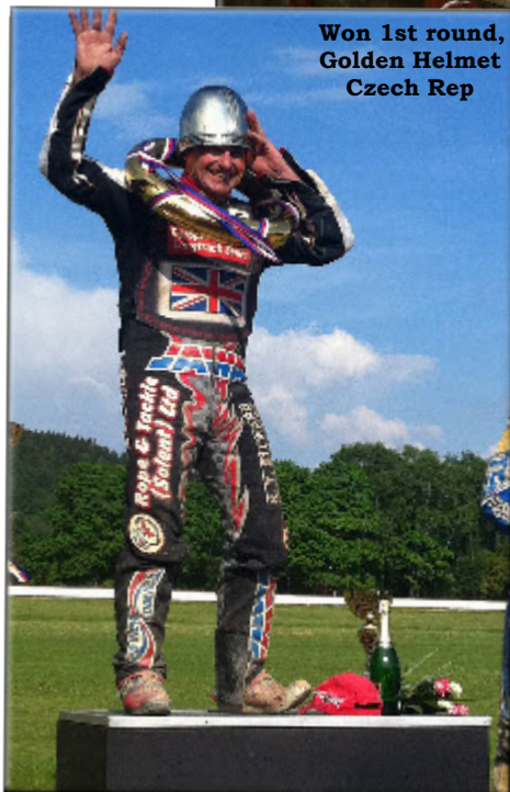
Won 1st round, Golden Helmet Czech Rep

demonstration race as part of the Speedway Riders Benevolent Fund meeting. In addition we have ridden the JAP at Coventry and Lakeside in May and July respectively.