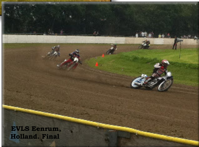
EVLS Eenrum, Holland. Final

Round 4 was in Eenrum . They close the little town to