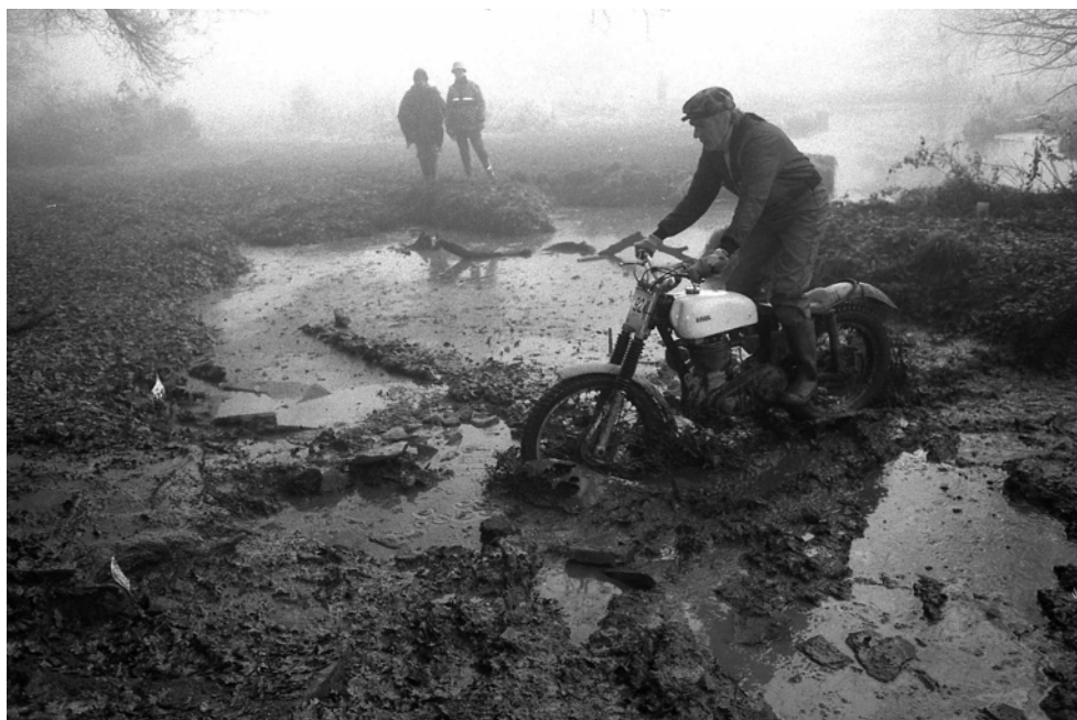
Thumpers 1991 rider 93 (EFA id 10)