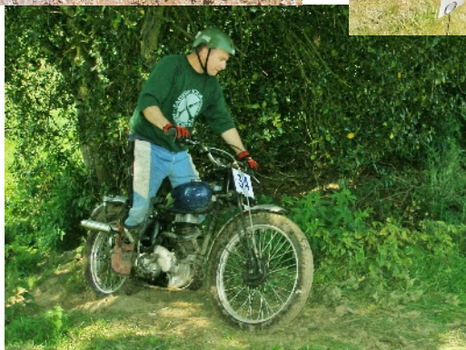
Photo's taken at the ACTC charity trial at Bromley Brook.