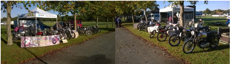
The EFA Stand at the Copdock Motorcycle Show.