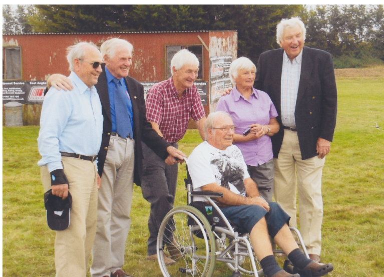
The 'Old Masters' at Dave Bickers Tribute Day