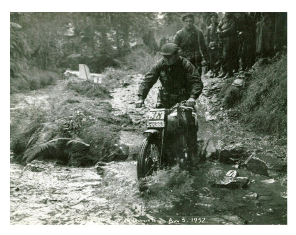
" A cracking shot of a rider easing into a section in the 1952 Clayton Trophy trial. Rock country sure enough - but surely that number plate is from Essex?"