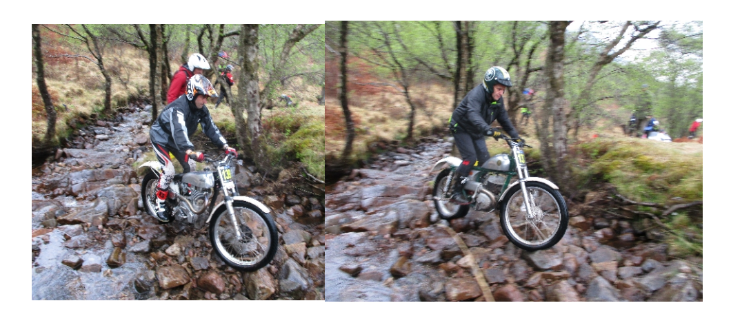
AND A COUPLE FANTIC 200'S AT THE SSDT