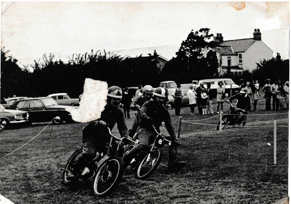
Moped speedway - St Osyth Fete 1970's