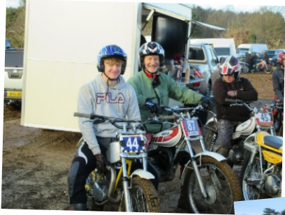
Laurie Bird memorial trial